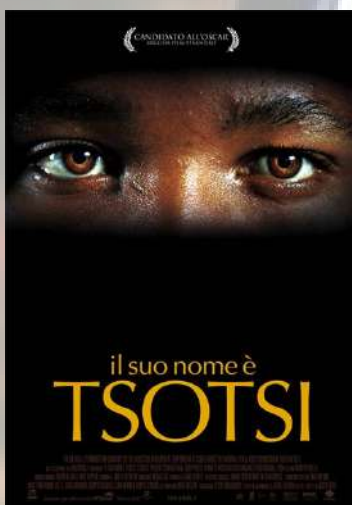
IL SUO NOME E' TSOTSI (2005) di Gavin Hood