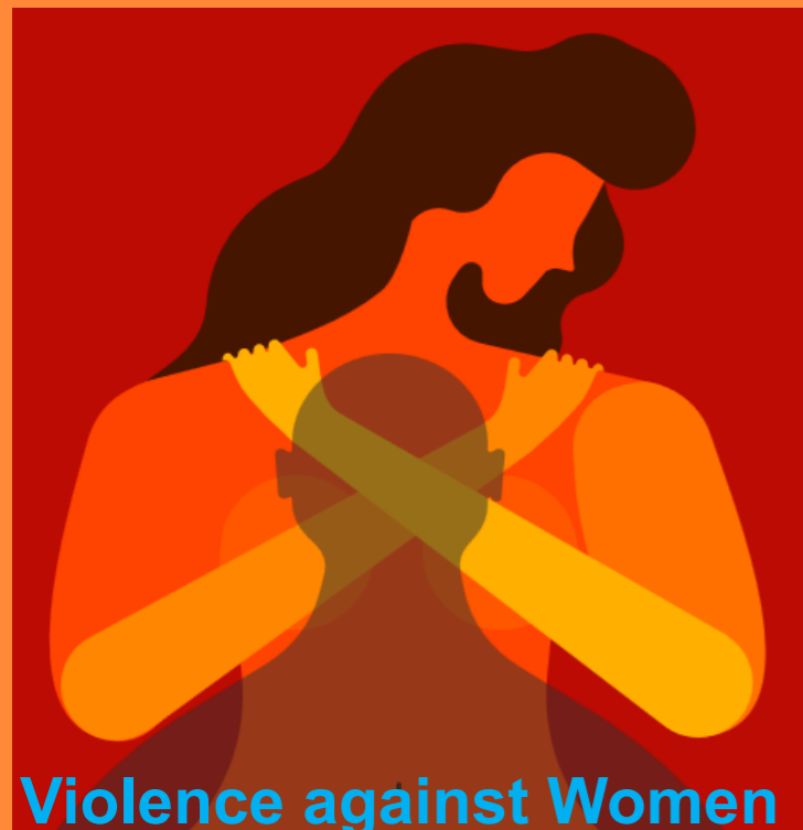
Violence against Women