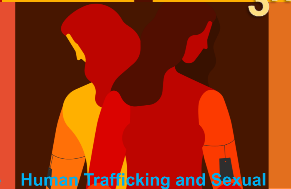
Human Trafficking and Sexual