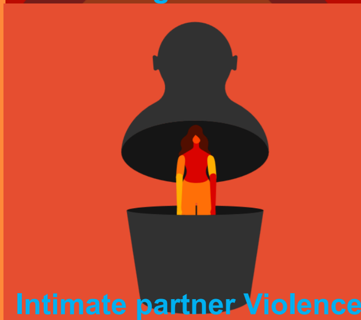
Intimate partner Violence